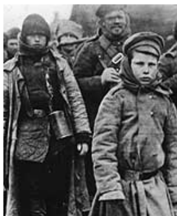
Russian prisoners after defeat in the first World war, 1915

Source A - Russia had the biggest army in the world, unfortunately they had some of the worst generals in the world who were very good at losing wars.